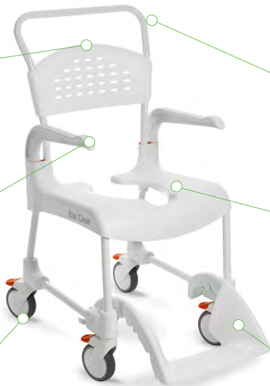
Clean, standard model

Unique legrest that is folded in underneath the chair when not in use. Curved footplate for comfort and relaxation.