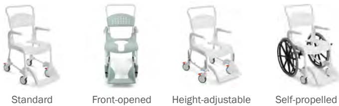
Standard Front-opened Height-adjustable Self-propelled