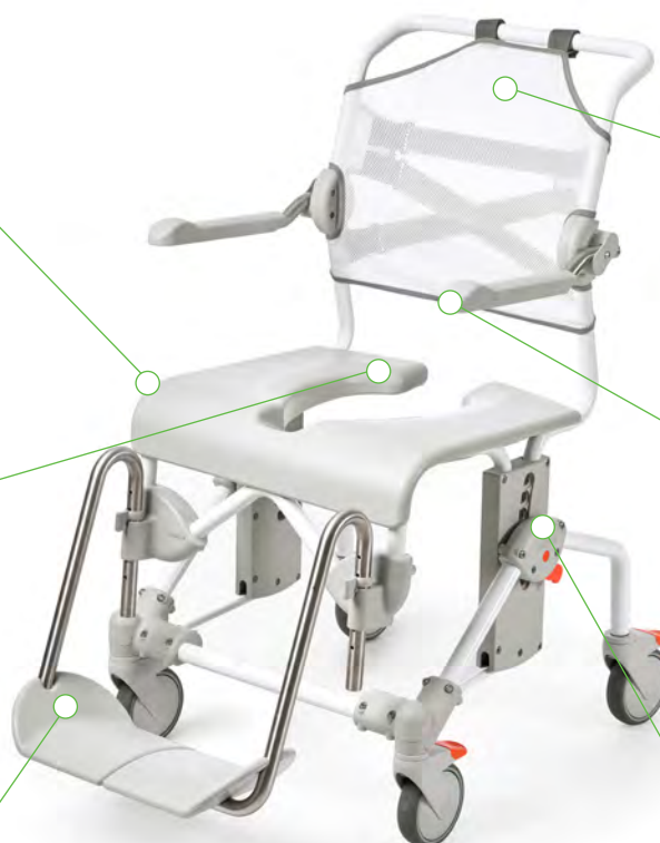
Swift Mobil -2, standard model

Easy to adjust to different seat heights, without any tools.