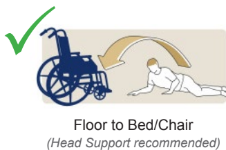
Floor to Bed/Chair (Head Support recommended)