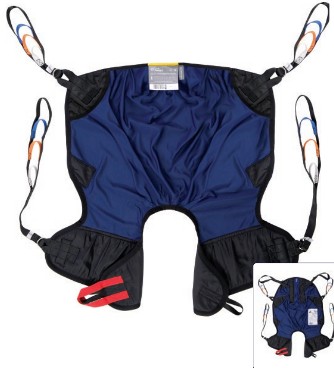
WITH HEAD SUPPORT

The Oxford® UltraFine Deluxe Leg sling incorporates flared leg sections for increased patient support. Made from a super-soft microfibre polyester, it offers excellent levels of comfort and the low-friction rip-stop nylon to the leg sections ensures easy application.