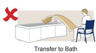
Transfer to Bath